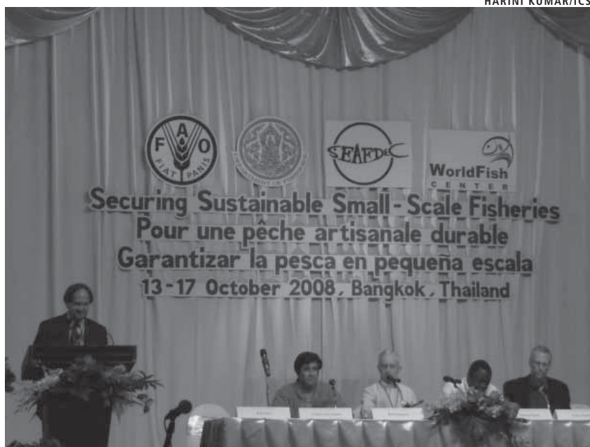
Panel session at the 4SSF Conference in Bangkok. The Conference was structured in a manner that lent it the potential to make progress