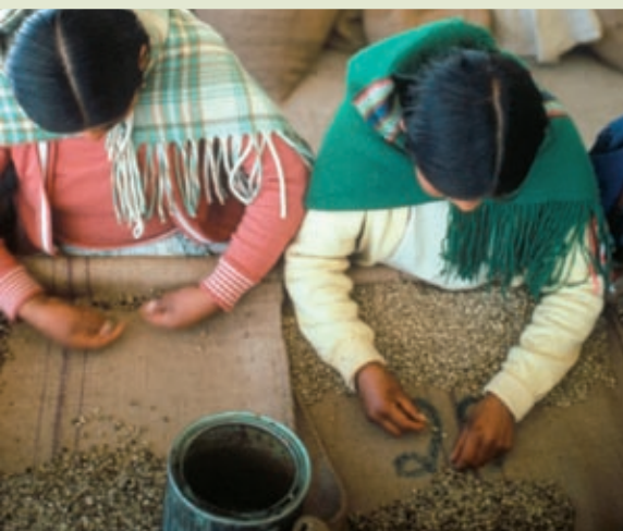
Women sorting coffee at a cooperative in the Puno District, Peru