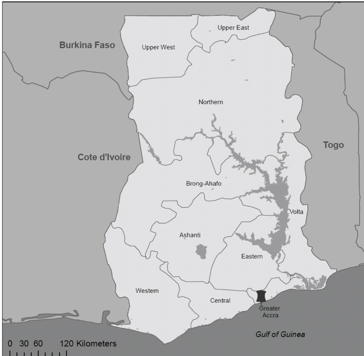
Appendix A: Map of Ghana