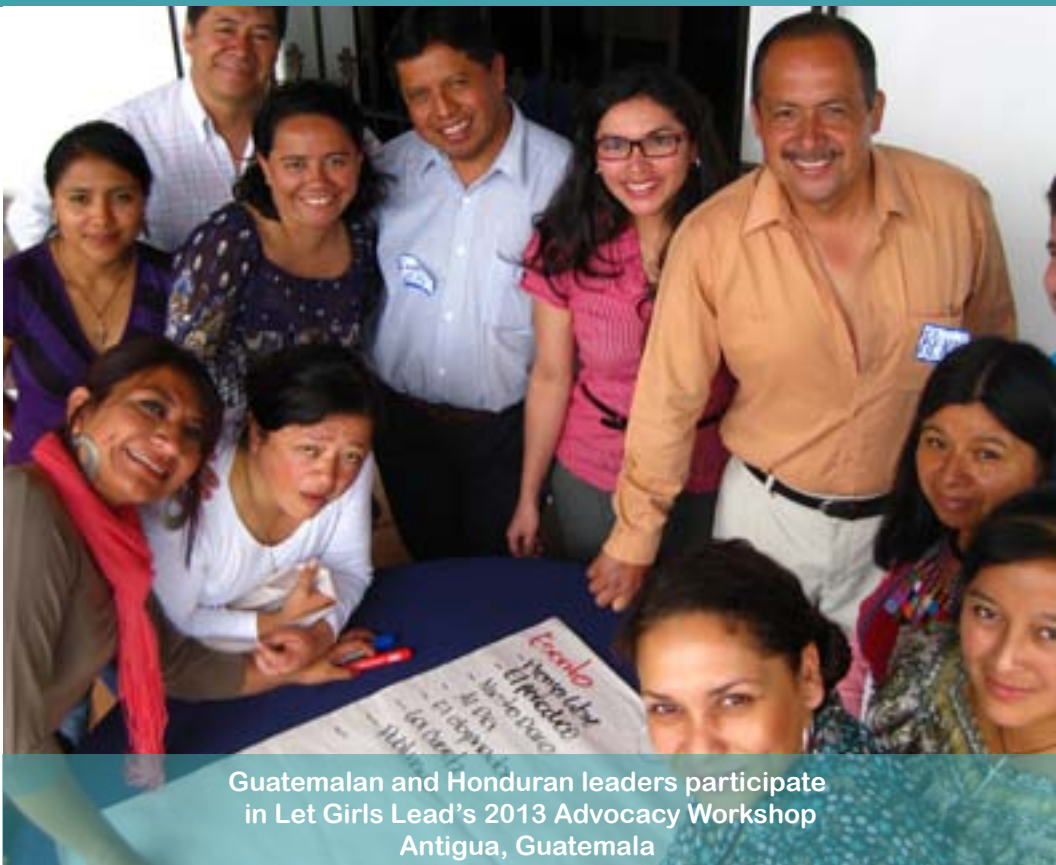
Guatemalan and Honduran leaders participate in Let Girls Lead's 2013 Advocacy Workshop Antigua, Guatemala