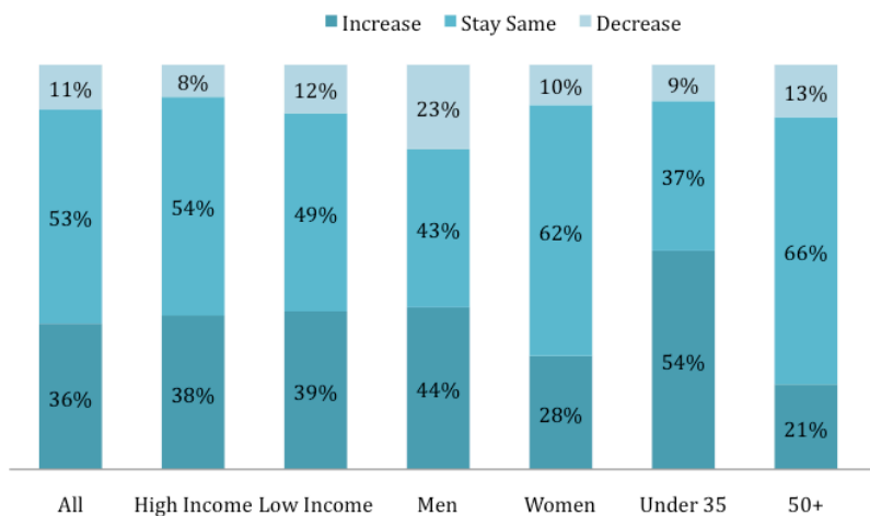
Fig. 3: Only people under age 35 say they will increase charitable giving in the coming year

Women are taking a more conservative approach to giving than men. Only 28 percent of women plan to give more in the coming year compared to 44 percent of men. Women also have higher expectations of a nonprofit’s must-have leadership qualities, ranking most attributes “very important” in their assessment. Both are in line with market research on female consumer and donor behavior: they tend to set the bar higher, and their support can take longer to cultivate. While these may be barriers, women are simply too important not to take seriously. They tend to give more time and money to causes than men, and they are more likely to spread the word about your good works. Our advice: don’t write them off. Understand what matters to them – and surpass the bar.